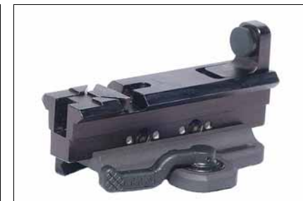
Detachable ARMS 17 Mount.

LIGHTLINK Mounts are available in a variety of models for most weapon systems. LIGHTLINK Mounts are available in Non-Recoil protected models, as well as three different recoil protected variants to meet almost any level of recoil.