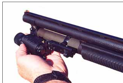
Shotgun I-Mount On Remington