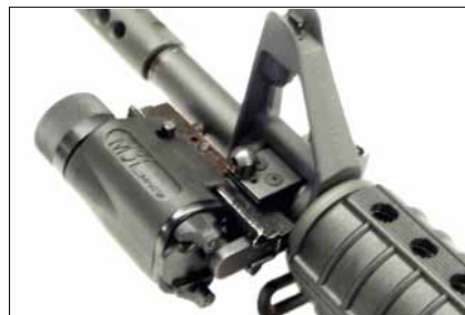
Rifle I-Mount On Colt