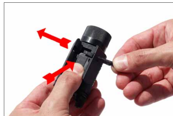
Step 3 - Depress the spring and insert the new replacement locking bar from right to left. Release the spring to lock the bar in place.

It is critical that the locking bar be correctly oriented toward the front of the light. If the locking bar is reversed, it will not lock in place, and the light will fall off the weapon during recoil.