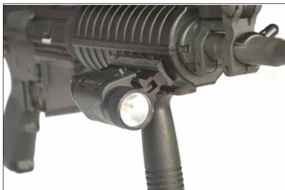
Streamlight M3 Light on M4

READ THESE MATERIALS BEFORE YOU USE THIS PRODUCT!