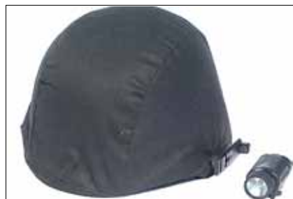
Adjustable Helmet Mount