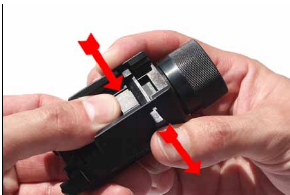
Step 1 - Depress the detent spring and push out the factory locking bar from left to right.