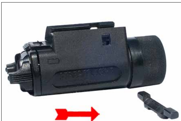
Step 2 - Orient your new locking bar (enclosed) toward the front of the light.