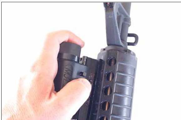
Seat light firmly (M3 shown here on forearm mount)

Reverse the process to dismount the light: Lift the locking bar and push the light forward until it clears the rail.